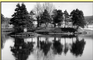
The Duck Pond in the 1960s.