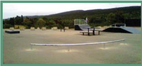
A photo of the recently upgraded Skate Board Park in Bowring Park.