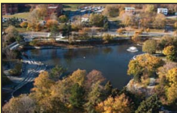
The Duck Pond today.