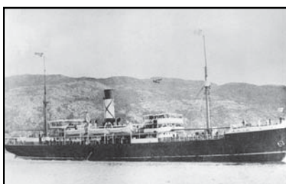
The Florizel .