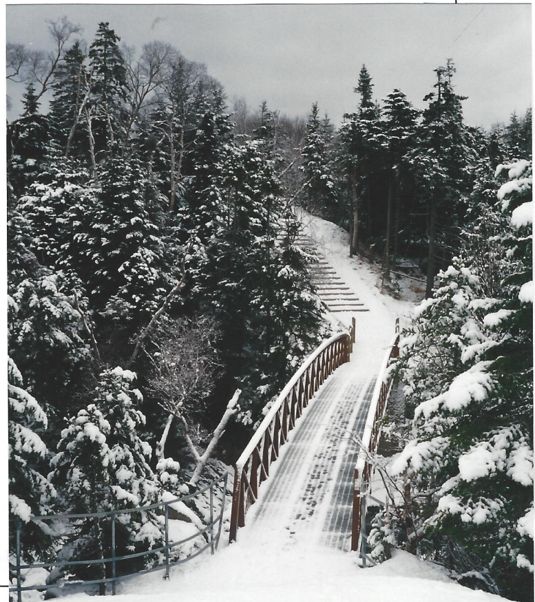
Captain's Falls Bridge