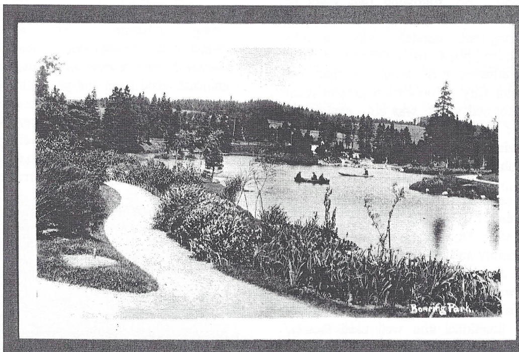
The Duck Pond (originally known as the Boat Lake) circa 1917-1920