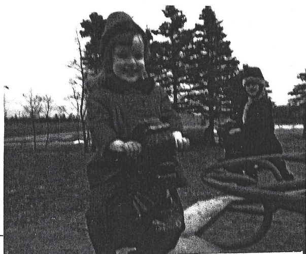
The Merry-Go-Round at Bowring Park Playground 1969