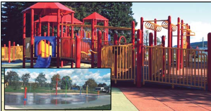
The Bowring Park Barrier Free Playground and Splash Pad

On October 15, 2009, the Bowring Park Foundation (BPF) and the City of St. John's officially opened the Barrier Free Playground and the Splash Pad in Bowring Park. This project, one of the initiatives from the 2005 Bowring Park Master Plan, was cost-shared by the BPF and the City. The Master Plan is focused on the preservation, restoration and development of the Park's landscape.