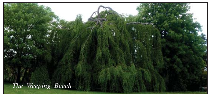
The Weeping Beech

One of Bowring Park's most popular trees is the extraordinary Weeping Beech located near the Bungalow. Planted in 1916, it stands out because it is a grafted tree. The root system for the Weeping Beech could not survive the Newfoundland climate so the top part of the tree was grafted onto the trunk and root system of a Green Beech. There is a prominent bump on the trunk where the graft was made. It has undergone some repairs and doctoring which will ensure that this special tree is around for a long time to come.